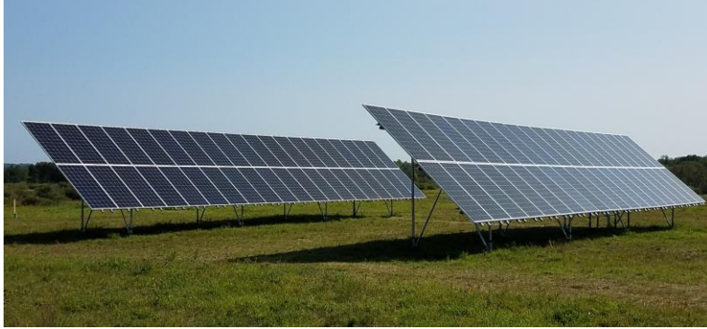
Detroit Lakes Public Utility's 29.3 KW Select Solar Community Solar Garden Detroit Lakes, MN