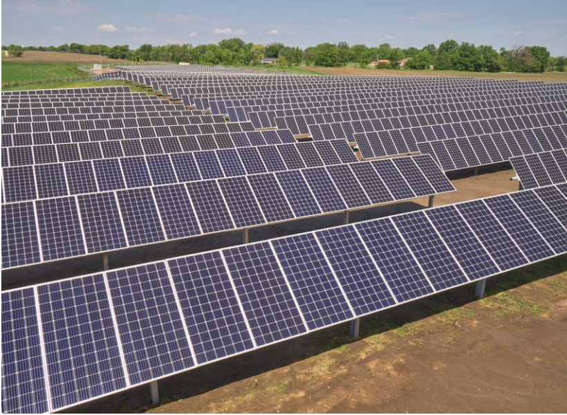
Minnesota Municipal Power Agency's 7 MW Buffalo Solar Buffalo, MN